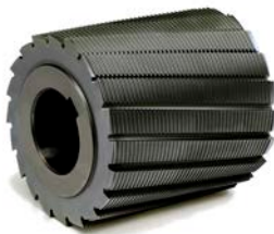
Alcrona Pro Coated Rack Cutter