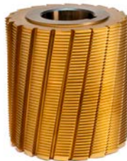
TiN Coated Rack Cutter